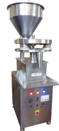
Semi-Automatic Cup Filler