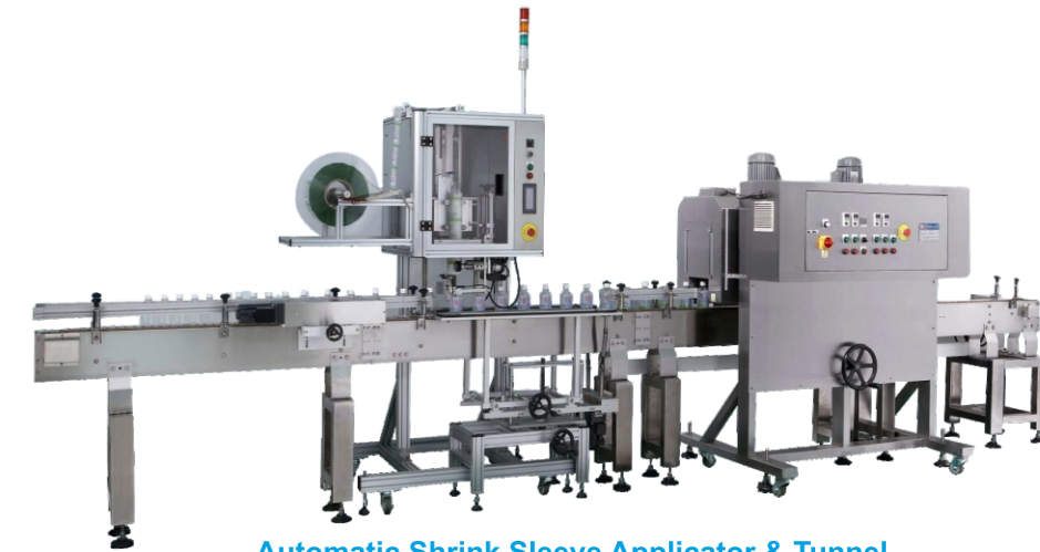
Automatic Shrink Sleeve Applicator & Tunnel