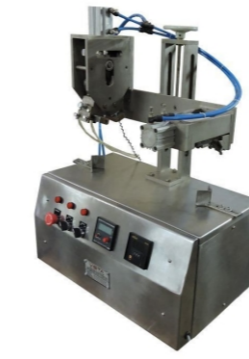
Table Top Tube Sealer