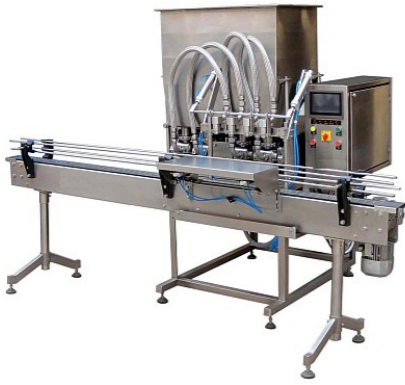
Automatic Piston Filling Machine