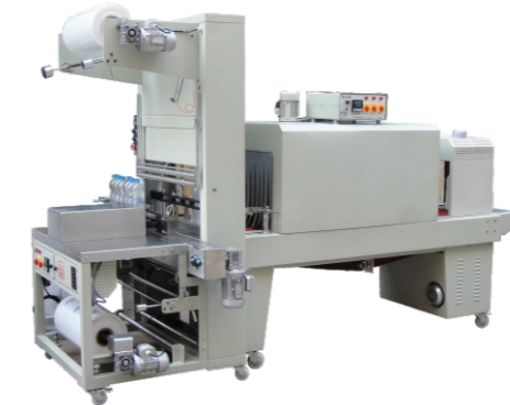
Automatic Web Sealer With Shrink Tunnel MS Powder Coated