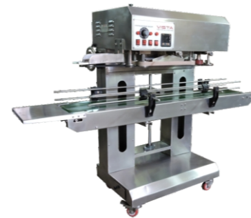
Continuous Band Sealer - VTMCS127