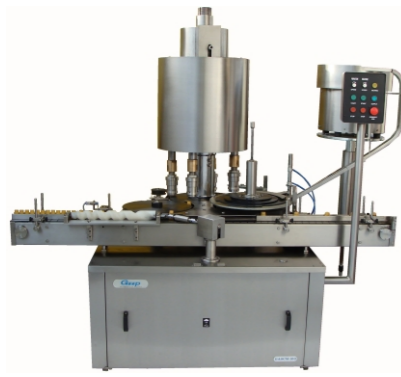
Automatic Screw Capping Machine