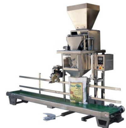
Linear Weigher With Stitching Machine & Conveyor