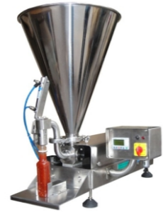
Semi-Automatic Piston Filler