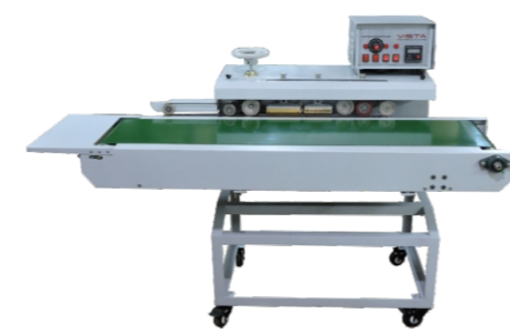
Continuous Band Sealer - VTMCS128