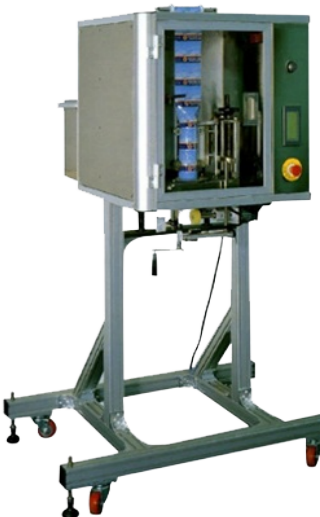
Shrink Sleeve Applicator