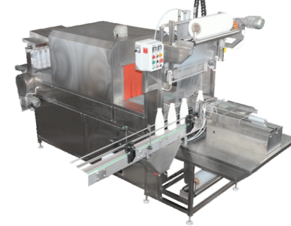
Automatic Web Sealer With Shrink Tunnel GMP Model