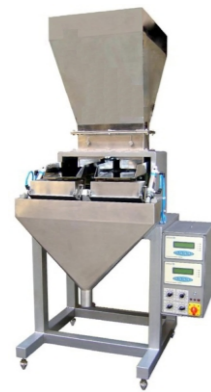
Semi-Automatic Linear Weigher