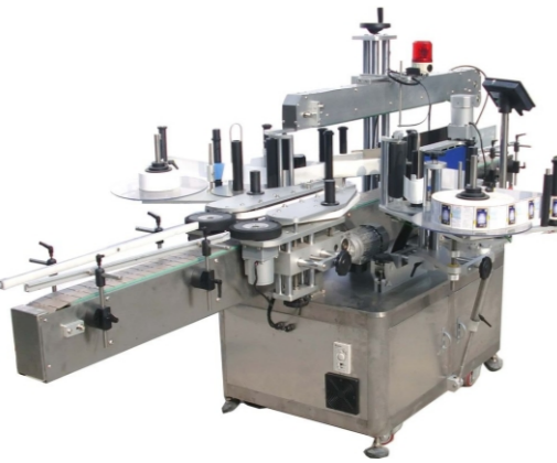
Automatic Front Back Labelling Machine