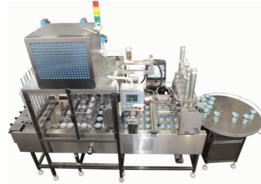
Cup Filling Sealing Machine with CIP