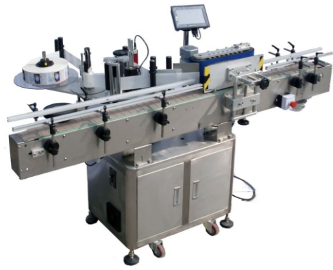
Automatic Wrap Around Labelling Machine