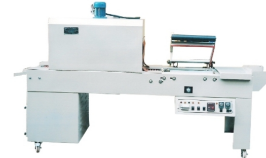
Shrink Tunnel With L-Sealer