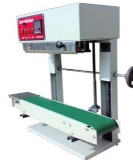
Continuous Band Sealer - VTMCS126