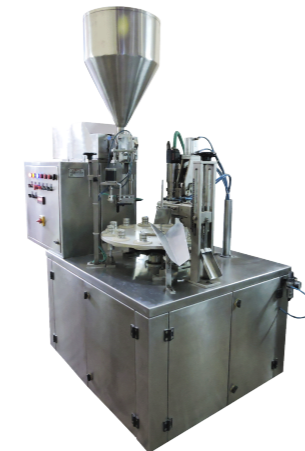
Semi-Automatic Tube Filling Machine