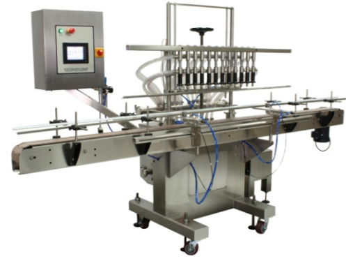
Overflow Liquid Filling Machine