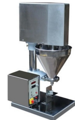
Semi-Automatic Powder Filler