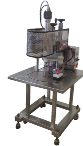
Hot Air Tube Sealer