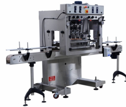
Automatic Spindle Capping Machine