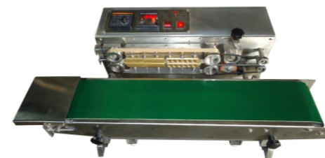
Continuous Band Sealer - VTMCS124