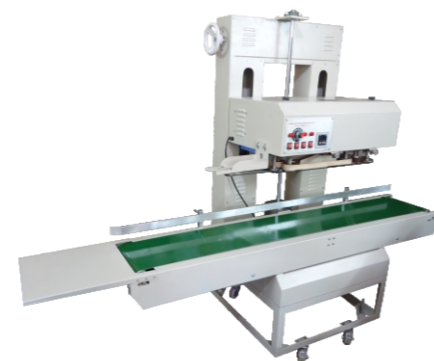
Continuous Band Sealer - VTMCS129