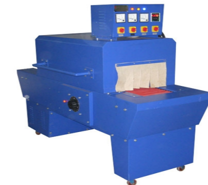
Shrink Tunnel Machine