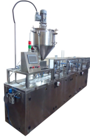
Cup Filling Sealing Machine